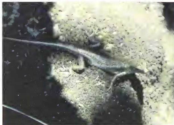
Fig. 10. Emoia a. atrocostata from Salibabu Island.

Distribution: According to BROWN (1991) the Talaud population of E. atrocostata belongs to the nominotypic subspecies. He examined one specimen from Karakelong (RMNH 18659). This coastal skink species is widespread ranging from the Philippines through the Indo-Australian Archipelago and many Pacific island groups such as the Carolines and Palau reaching North Australia. This is the first record of E. a. atrocostata for Salibabu Island.